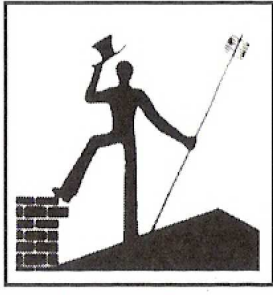
A CURE FOR THE FLUE